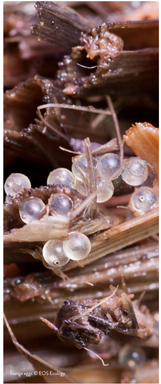
Inanga eggs