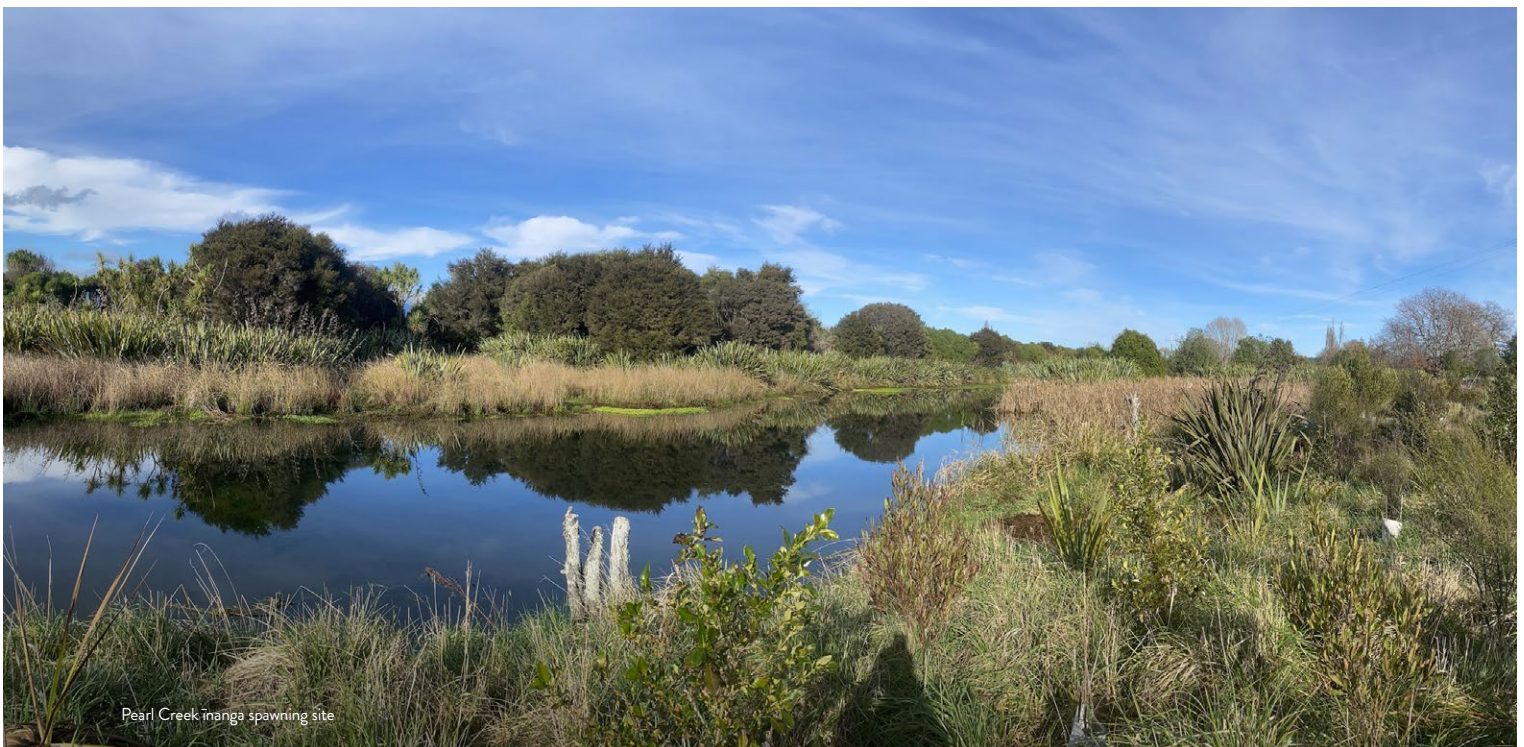
Pearl Creek inanga spawning site